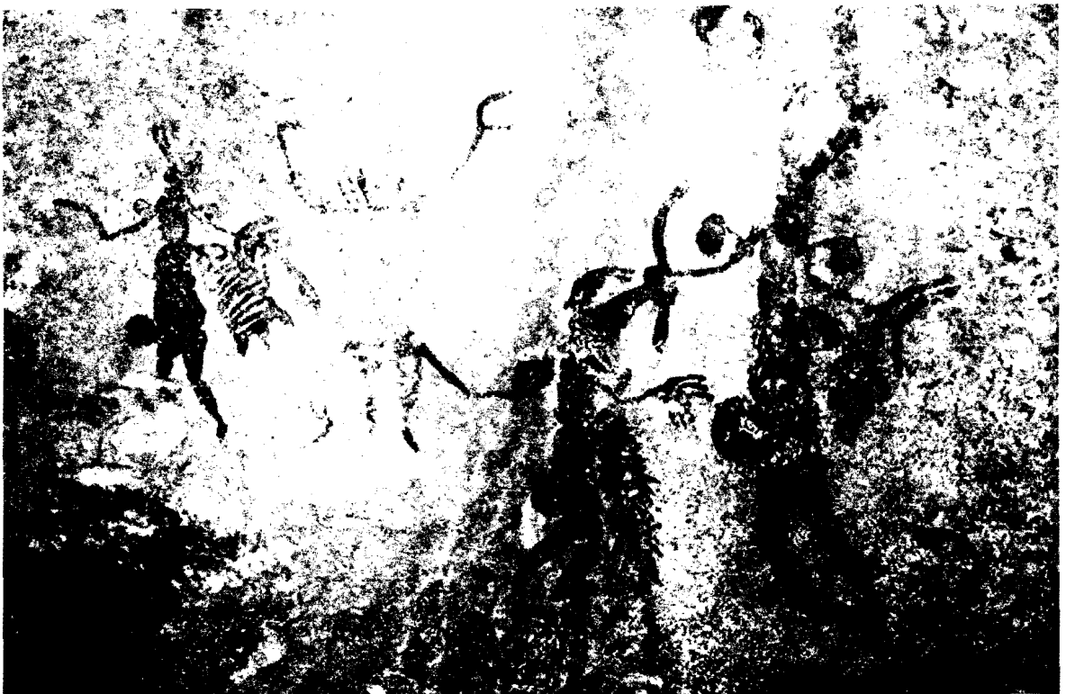
Fig. 3. Three Sash Figures that resemble the Aboriginal sky-hero, Baiame. Note the large projections extending from the heads (left figure 21 x 13.5 cm).