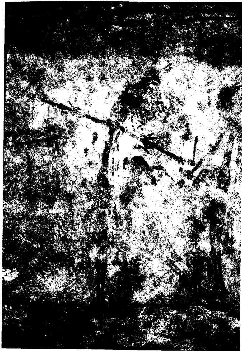
Fig. 4. The central Tasseled Figure is possibly a female shaman and may be wearing a mask. The dotted lines, among various possibilities, could be liquid quartz crystals from Baiame (central figure 40 x 29.5 cm).