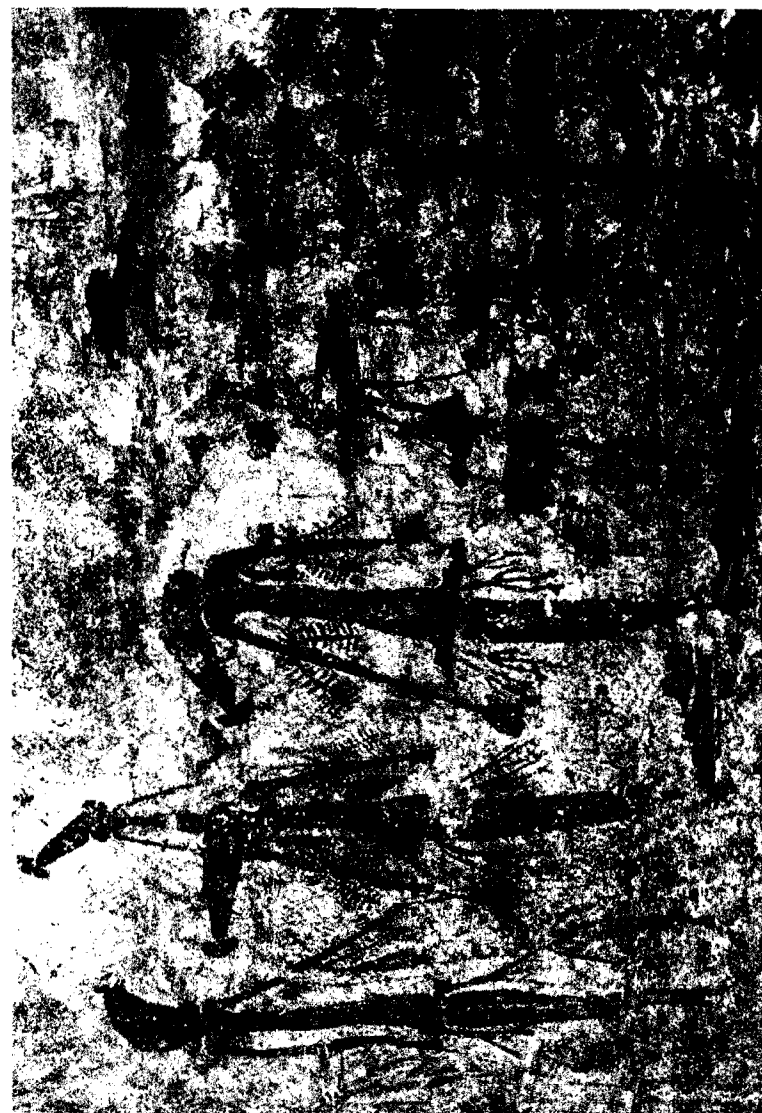
Fig. 5. Panel of Tasseled Figures showing headdresses or hats pointing in all directions suggesting dynamic movement, which is probably related to ecstatic dancing or a shamanistic vision quest (figure third from right 117 x 45.5 cm).